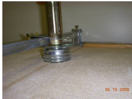
Incorrect clip for concealed sprinkler