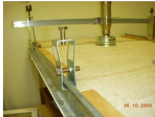
Same squeeze type clip correctly installed