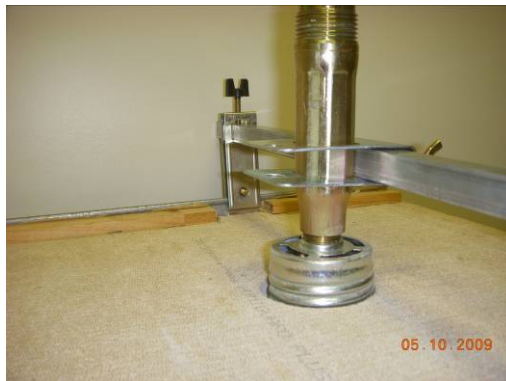
Correct clip for concealed sprinkler