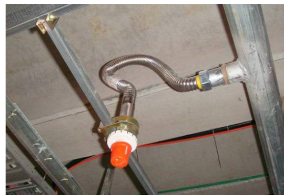
Two examples of over length flexible droppers, with excessive number of bends, or bends not meeting minimum bend radius requirements.