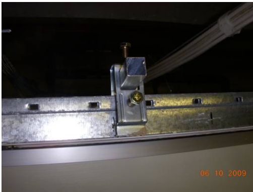
Squeeze type clip installed in a clamp style